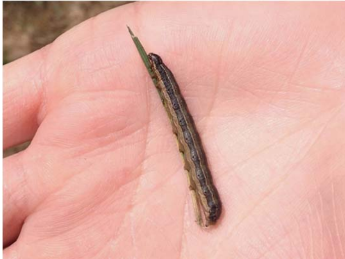
Army worm taken from turf grass in southern Indiana

By Doug Richmond, Turf Entomologist, Purdue