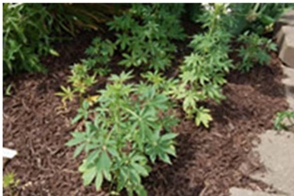
Cleome plants recovering from sour mulch injury

Although the benefits of mulching garden plants are many, wood mulch that has been improperly stockpiled can lead to plant injury or even death. Young herbaceous plants are the most susceptible to such injury, which becomes obvious shortly after applying a hardwood bark mulch. Plants may look like they have been burned with fertilizer or pesticides, or possibly, are under severe water stress. All of the above could potentially be a problem, but, apparently, we must now add "sour mulch" to the list of suspects.