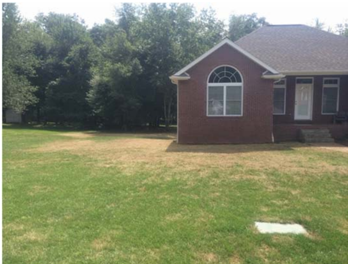
A home lawn in southern Indiana showing typical armyworm damage

There appears to be a wide-spread outbreak of armyworms [ Pseudaletia (= Mythimna ) unipuncta (Haworth)] infesting residential turf across southern Indiana. These insects typically have two generations per year in this part of the country, and we are in the midst of the second generation of larvae. Adult armyworm moths lay their eggs in large masses and when the eggs hatch, the resulting caterpillars begin to feed and move across the infested area. When the larvae are small, this feeding causes little damage and may go unnoticed. However, as development proceeds, the larvae increase in size, consuming larger amounts of turf.