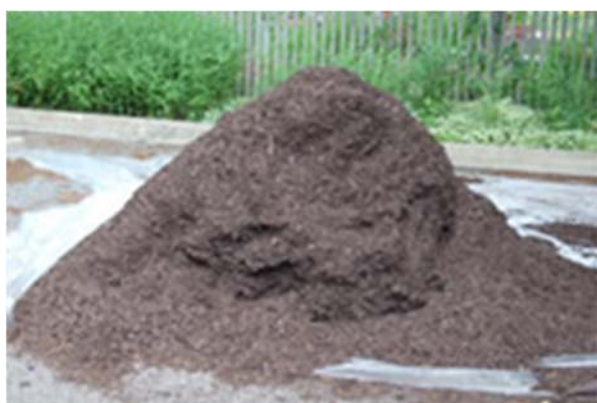
Hardwood bark mulch can turn sour

However, the more serious problem is that anaerobic composting of hardwood leads to the production of several plant-damaging components; methane, alcohol, ammonia and hydrogen sulfide are possibilities.