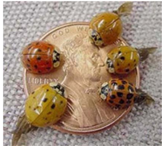
Multicolored Asian lady beetles

A. There are thousands of species of lady beetles in the world, and about 400 of them can be found in the U.S.! The multicolored Asian lady beetle was introduced to the U.S. a few decades ago and has certainly been successful in colonizing here! While mostly beneficial in eating insect pests such as aphids, they also are a nuisance because they like to spend the winter months inside our homes. They can also occasionally feed on ripe fruits and release a rather unpleasant odor.